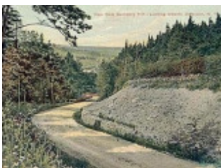
Looking from Quaker St toward Delanson on 395

We await further guidance from Governor Hochul and her administration and hope to have more information to communicate regarding booster shots soon.