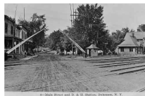
Railroad crossing looking north