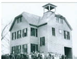
School house 1884