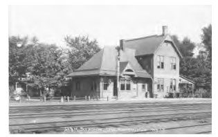
Train station, currently the Fire Department parking lot